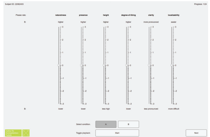
Figure 2: A screenshot of the questionnaire GUI in MATLAB. “A” refers to the reference, whereas the condition under test is labeled “B”.

In the experiment, the subjects were presented two conditions at a time, i.e., the reference and a condition under test (which was either the stereo anchor or one of the upmixed versions). After having listened intently to both conditions, the subjects were asked to rate the perceived quality of the condition under test relative to the reference. Each of the verbal descriptors had to be rated on a continuous bipolar scale that ranges between \pm 3 , where a value of zero marks the middle (“no difference perceived”). Whereas a positive difference rating indicates that the subject perceived the condition under test to be higher in spatial quality than the reference, a negative difference rating translates to the opposite. To control for possible confounding factors, the musical pieces and conditions were presented in random order. The order of the verbal descriptors was also randomized across subjects, but not varied between comparisons to reduce the cognitive load. The questionnaire which allowed the participants to control the audio playback and enter their